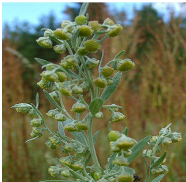
Figure 3 Plant of Artemisia absinthium ('Chinese wormwood').

Phytochemicals have long been used as 'lead compounds' to generate drugs with better pharmacokinetic profiles and reduced toxicity in vivo . Artesunate (ART) and dihydro-ART are semi-synthetic derivatives of artemisinin with demonstrable activity against a wide range of cancer cell lines including KML-562 (chronic myeloid leukaemia), HeLa (cervical cancer) and HO-8910 (ovarian cancer) [60-62]. Human umbilical vein endothelial cells (HUVECs) are commonly employed alongside cancer cell assays to assess the extent to which angiogenesis is induced by way of new micro-vessel tube formation. Studies using this model show that dihydro-ART has significant anti-angiogenic activity compared to ART and prevents new-microvessel formation by 70–90% in vitro [61]. Along with the low toxicity profile associated with