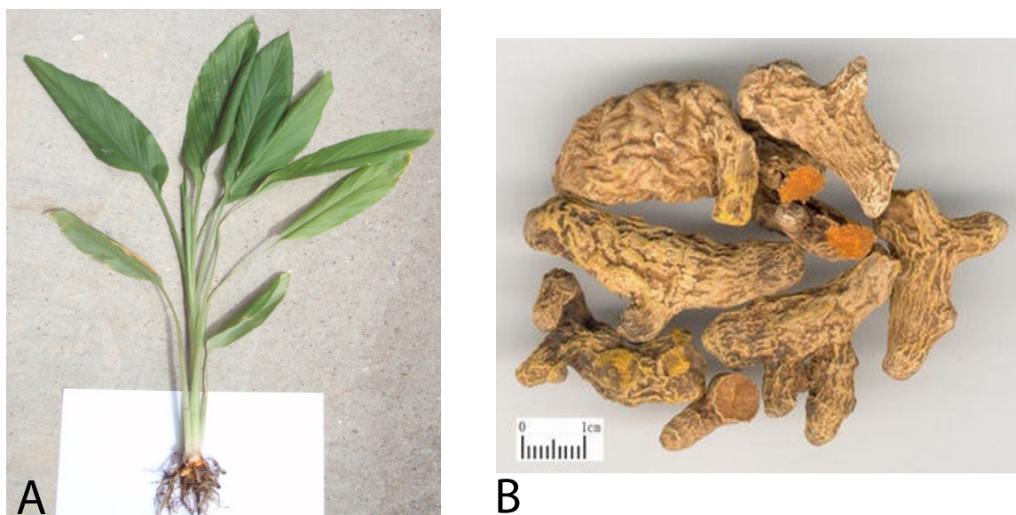
Figure 4 Plant (A) and root (B) of Curcuma longa ('curcumin') where root scale is shown as 1 cm.

TCM often possess quite distinct and specialised modes of action, and consequently tumours normally resistant to conventional chemotherapy are reported to be more susceptible to TCM therapy [79]. They have demonstrable and often direct inhibitory effects on tumour cell growth and proliferation, affecting different stages of the cell growth cycle and mitotic phase [80]. Herbal compounds such as paclitaxel (Taxol®) and its derivatives suppress microtubule depolymerization, thus terminating cell mitosis [81]. As a result these, and compounds including harringtonine ( Cephalotaxus hainanensis ) and camptothecin ( Camptotheca acuminata ) with similar mechanisms of action are already commonly used in the clinic as anticancer agents for a variety of cancers [82]. The mechanism of action of camptothecin ( Camptotheca acuminata ) being to inhibit DNA topoisomerase I, consequently affecting DNA replication; paclitaxel is a mitotic spindle inhibitor (spindle poison), which can also bind with tubulin and prevent the normal physiological process of microtubule depolymerization.