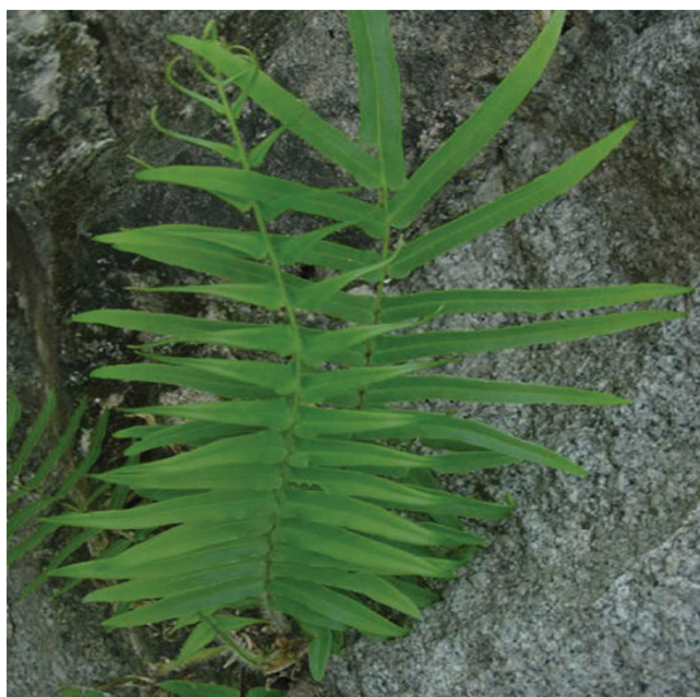
Figure 5 Plant of Pteris semipinnata L. ('half-flag').