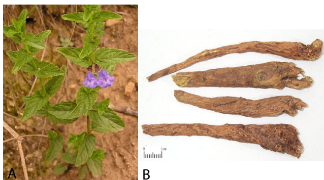
Figure 2 Plant (A) and root (B) of Scutellaria Baicalensis ('golden root') where root scale is shown as 1 cm.

tory (cyclooxygenase-2 (Cox-2)) and tumour cell proliferatory (lipoxygenase) markers [25]. Simultaneous inhibition of Cox-2 and 12-lipoxygenase has been shown to result in both reduced inflammation and tumorigenesis [25,26]. The role of baicalein against cell proliferation in PC-3 and DU145 prostate cancer cell lines is that of cell cycle arrest (at G 0 -G 1 ) while also inducing apoptosis – confirmed via detection of caspase-3, at concentrations typical for administration to humans [27].