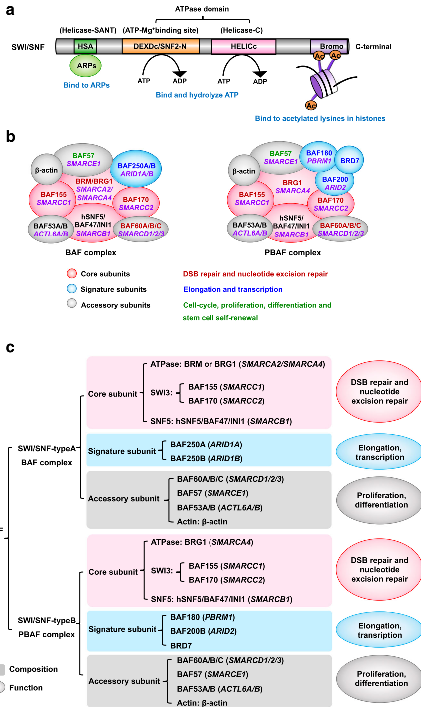
Fig. 1 The structure and composition of the SWI/SNF complexes in human. a The structure of the SWI/SNF complexes. The SWI/SNF complexes contain a DNA-dependent ATPase as its catalytic subunit and distinct flanking domains, such as HSA and bromodomain. b The subfamily of the SWI/SNF complexes. The SWI/SNF complexes consist of several core subunits ( pink ), signature subunits ( blue ) and additional accessory subunits ( gray ). The subunit coded gene is marked in purple with italics . Different colors of characters in a complex indicate the function of various subunits. c The outline of the SWI/SNF complexes. The SWI/SNF complexes are divided into two types: BAF and PBAF . Two types of the SWI/SNF complexes contain different subunits, which are related to distinct functions